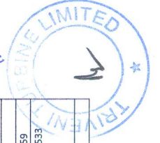
Table - II: Shareholding Pattern of Promoters and promoter Group